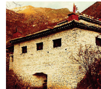
The "Temple Of Miraculous Fire" at Muktinath, Nepal. Photo by Ken Street (November 1979).

[For more on this subject, please read our tract The Temple Of Miraculous Fire. ]